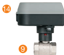
Motor + Kaskadenventil