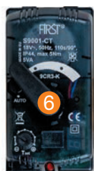
tubra® STM S KR