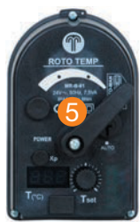
tubra® STM KR